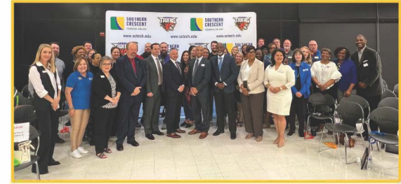
Connect - SCTC participants and sponsors

While at industry sites and medical facilities in the area, educators will meet with key leaders to learn about the mission and vision of the company, participate in a tour, and shadow